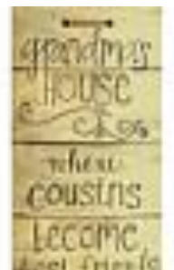
Gifts for relatives