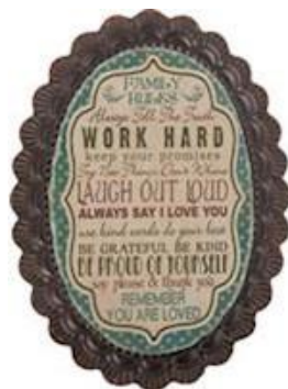
Gifts for families