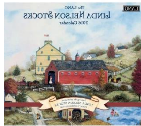
Lang Calendars and Planners

WHAT YOU WILL FIND 'ROUND THE FAMILY HEARTH