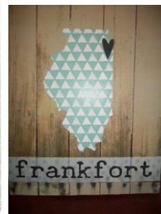
Exclusive Frankfort signs