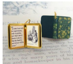
Charmed Book Charms